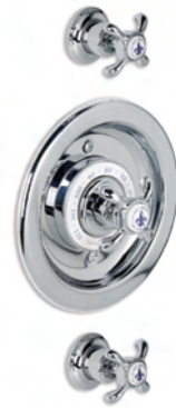
FR 8801 WITH FH 5000 LA CHAPELLE CONCEALED THERMOSTATIC MIXING VALVE WITH TWO FLOW CONTROLS