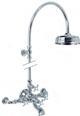
FH 1156 LA CHAPELLE WALL MOUNTED BATH SHOWER MIXER WITH RISER AND 8" ROSE