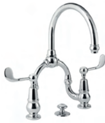
FL 9000 LA CHAPELLE BASIN BRIDGE MIXER WITH LEVER & POP-UP WASTE (LEVER HANDLES ARE AVAILABLE ON OTHER PRODUCTS ON REQUEST)