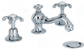
FH 1204 LA CHAPELLE THREE HOLE BASIN MIXER WITH POP-UP WASTE