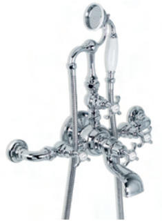
FH 1146 LA CHAPELLE WALL MOUNTED BATH SHOWER MIXER 22MM (3/4")