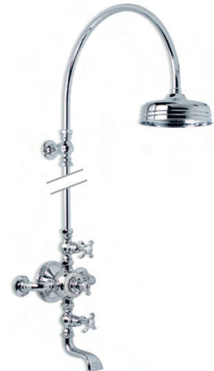
FR 8630 LA CHAPELLE EXPOSED THERMOSTATIC SHOWER WITH 8" ROSE AND BATH FILL