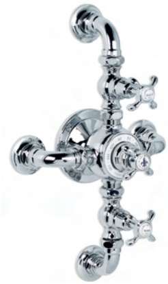
FR 8635 EXPOSED DUAL CONTROL LA CHAPELLE THERMOSTATIC MIXING VALVE WITH TOP AND BOTTOM RETURN BEND TO WALL FOR CONCEALED SHOWER OUTLETS