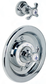
FR 8801 LA CHAPELLE CONCEALED THERMOSTATIC MIXING VALVE WITH FLOW CONTROL