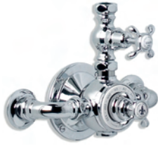
FR 8600 EXPOSED DUAL CONTROL LA CHAPELLE THERMOSTATIC MIXING VALVE