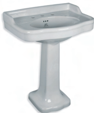
LB 7703 WITH LB 7704 LA CHAPELLE THREE HOLE BASIN (57CM) WITH PEDESTAL (THE FULL RANGE OF BASINS ARE SHOWN IN OUR CHINAWARE BROCHURE)