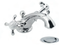
FH 1189 LA CHAPELLE BASIN MONOBLOC WITH POP-UP WASTE