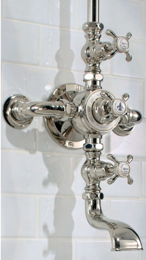
Left: FR 8630 Exposed Thermostatic Shower with Bath Fill (detail).