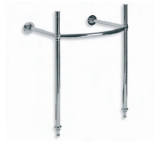
LB 3227 BALL JOINTED STAND FOR LA CHAPELLE BASIN (72CM) (THE FULL RANGE OF TUBULAR STANDS ARE SHOWN IN OUR CHINAWARE BROCHURE)