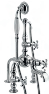
FH 1140 LA CHAPELLE DECK MOUNTED BATH SHOWER MIXER (3/4")