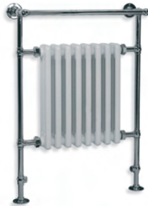
LB 3202 CLASSIC BALL JOINTED CAST IRON RADIATOR (THE FULL RANGE OF RADIATORS ARE SHOWN IN OUR ACCESSORIES BROCHURE)