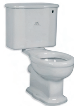
LB 7707 WITH LB 7708 LA CHAPELLE CLOSE COUPLED PAN WITH CISTERN (THE FULL RANGE OF SANITARY WARE IS SHOWN IN OUR CHINAWARE BROCHURE)