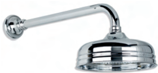
FR 1784 LA CHAPELLE WALL MOUNTED 8" ROSE SHORT ARM (400MM)