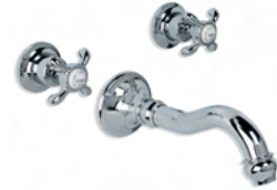
FH 1290 LA CHAPELLE WALL MOUNTED THREE HOLE BATH FILLER