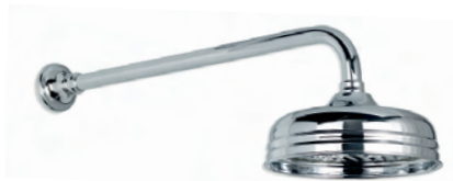
FR 1785 LA CHAPELLE WALL MOUNTED 8" ROSE LONG ARM (550MM)