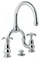
FH 9000 LA CHAPELLE BASIN BRIDGE MIXER WITH POP-UP WASTE