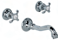
FH 1208 LA CHAPELLE WALL MOUNTED THREE HOLE BASIN MIXER