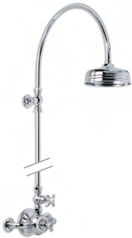
FR 8610 LA CHAPELLE EXPOSED THERMOSTATIC SHOWER VALVE WITH RISER AND 8" ROSE.