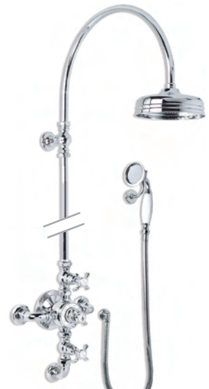
FR 8615 EXPOSED THERMOSTATIC VALVE WITH WALL RETURN & RISER KIT, HANDSET AND WALL CRADLE AND 8" ROSE