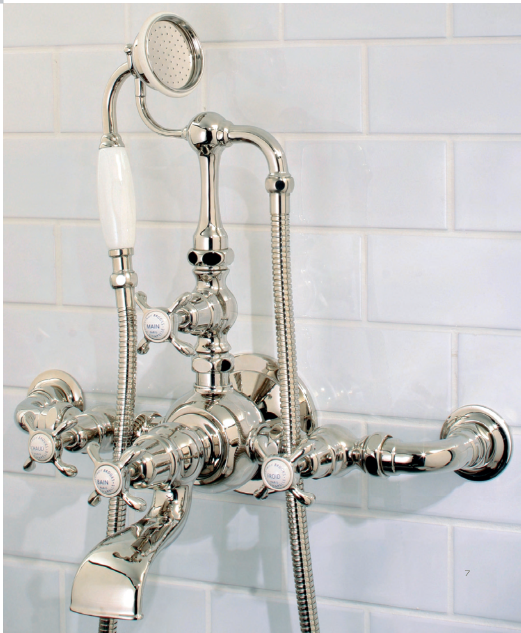
Below: FR 1146 La Chapelle Wall Mounted Bath Shower Mixer.