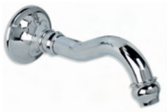
FR 2210 LA CHAPELLE BATH WALL SPOUT (3/4")