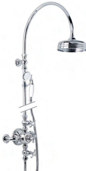
FR 8620 EXPOSED THERMOSTATIC VALVE AND RISER KIT, HANDSET & RISER CRADLE AND 8" ROSE