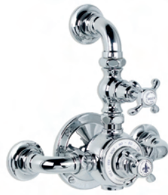
FR 8625 EXPOSED DUAL CONTROL LA CHAPELLE THERMOSTATIC MIXING VALVE WITH TOP RETURN BEND TO WALL FOR CONCEALED SHOWER OUTLET