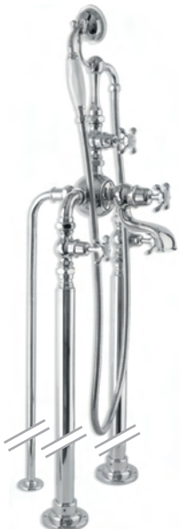
FH 1148 LA CHAPELLE BATH SHOWER MIXER WITH STANDPIPES