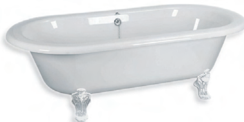
LB 8623 CHATEAU SUPER SIZE 'BIGGER, WIDER, DEEPER' DOUBLE ENDED BATH