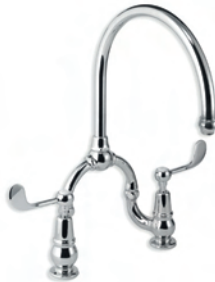
FL 1530 LA CHAPELLE DECK MOUNTED LEVER KITCHEN MIXER (LEVER HANDLES ARE AVAILABLE ON OTHER PRODUCTS BY REQUEST)