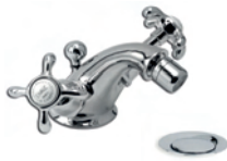
FH 1199 LA CHAPELLE BIDET MONOBLOC WITH POP-UP WASTE